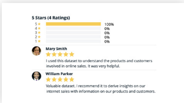
Figure 1: Easily collaborate with data leveraging crowdsourcing capabilities